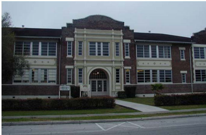
Haines City Community Center

The study consisted of four (4) primary elements, including an existing conditions analysis and needs/issues assessment. The study utilized an extensive public involvement and local government coordination plan to produce a comprehensive plan overlay for future land use, city-wide parks and recreation master plan and a future transportation network plan that incorporated the existing street system, the planned long-range roadway improvements from the Polk County TPO plan and the recommended local and county roadway system necessary to serve the future transportation demand at the adopted level of service.